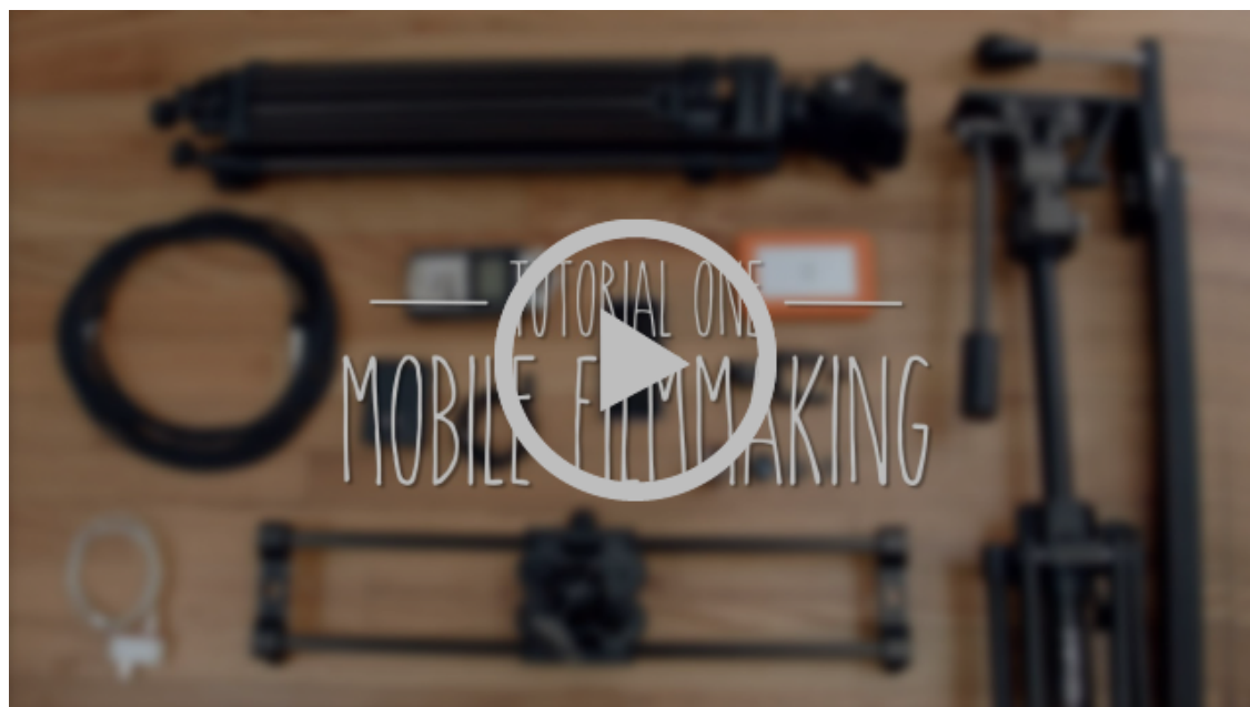
Iphone Film Making