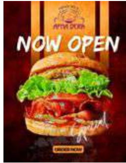
Apna Dera & Mister Dee's Restaurant