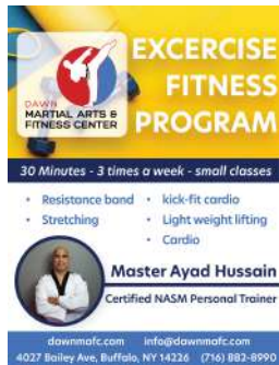
Dawn Martial Arts and Fitness Center