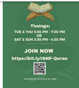
ISNF Hafithoon Quran Academy Registration for Spring 2025