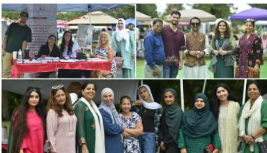
WNY Health Fair 2025: A Celebration of Unity, Health, and Heritage

WNY Muslims can cover your event by providing media coverage, publicity, and more. If you are interested, please click here .