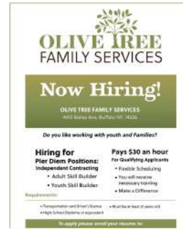
OTFS is Hiring