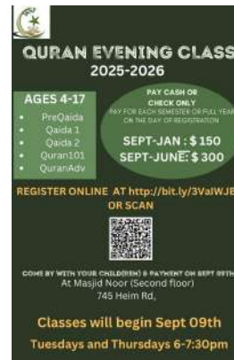
Quran Evening Class Beginning Sept 09th