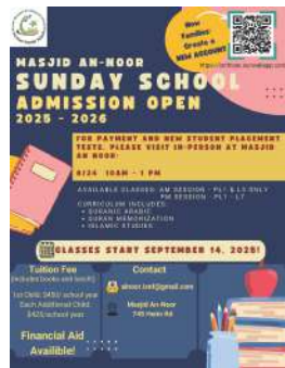
Sunday School Admission September 14, 2025