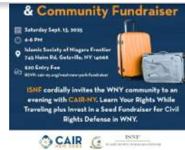
CAIR Event for Muslim Community September 13th, 2025