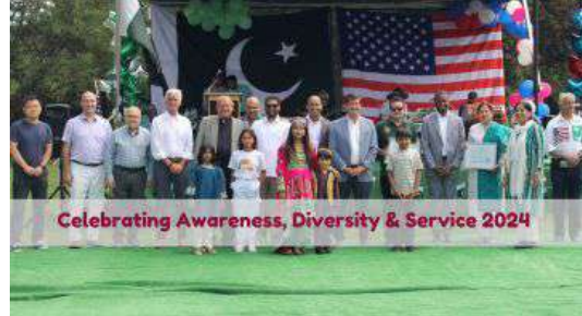
Celebrating Awareness, Diversity & Service 2024