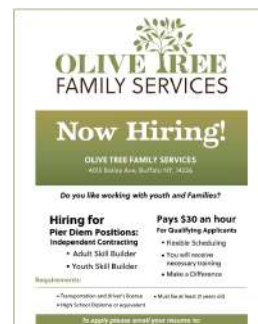
OTFS is Hiring