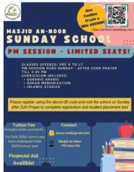
An-Noor Sunday School 2024-2025