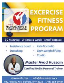
Dawn Martial Arts and Fitness Center