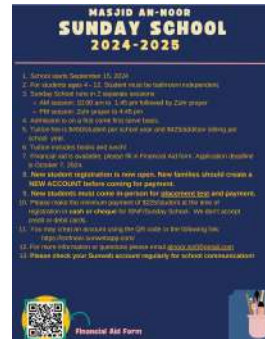
An-Noor Sunday School 2024-2025