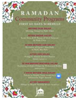
Daily Ramadan Schedule