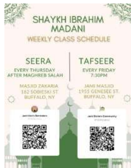
Tafseer Halaqa Every Friday@ 7:30 PM