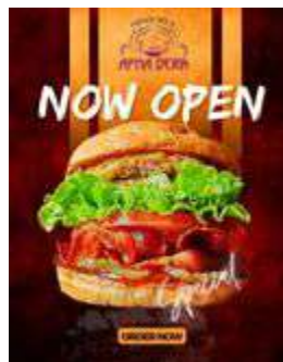
Apna Dera & Mister Dee's Restaurant