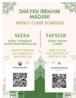
Tafseer Halaqa Every Friday@ 7:30 PM