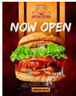
Apna Dera & Mister Dee's Restaurant