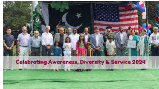
Celebrating Awareness, Diversity & Service 2024