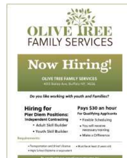
OTFS is Hiring