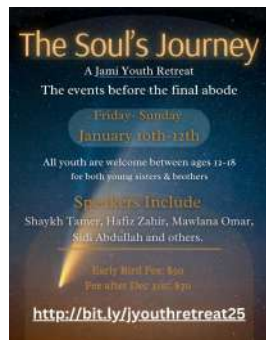
Youth Retreat January 10th-12th