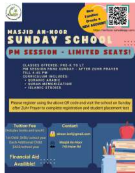
An-Noor Sunday School 2024-2025