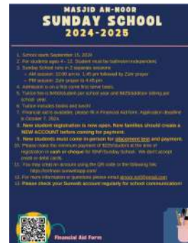
An-Noor Sunday School 2024-2025