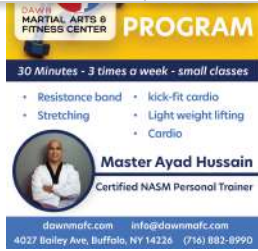
Dawn Martial Arts and Fitness Center