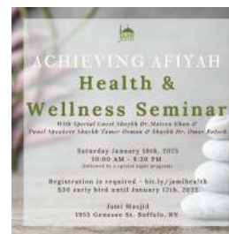
health & Wellness Seminar January 18th