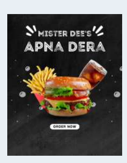
Mister Dee's Apna Dera Restaurant