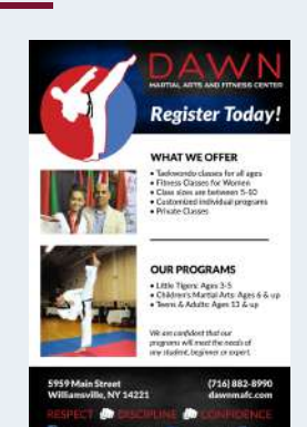
Dawn Martial Arts and Fitness Center