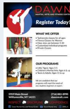
Dawn Martial Arts and Fitness Center