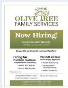
OTFS is Hiring