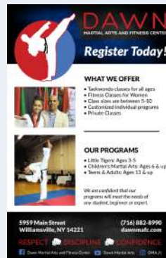
Dawn Martial Arts and Fitness Center