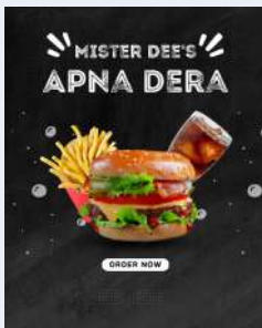
Mister Dee's Apna Dera Restaurant