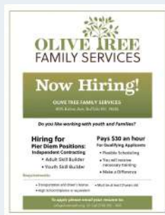
OTFS is Hiring