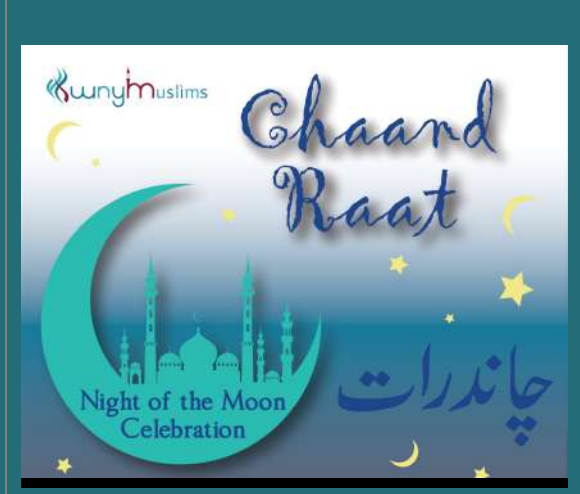
Please click <u>here</u> for the event coverage.