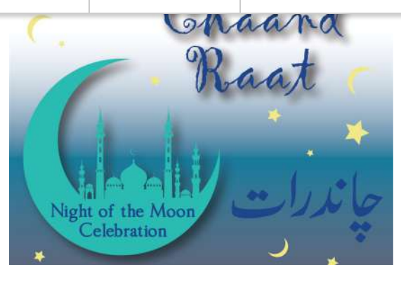
Please click <u>here</u> for the event coverage.