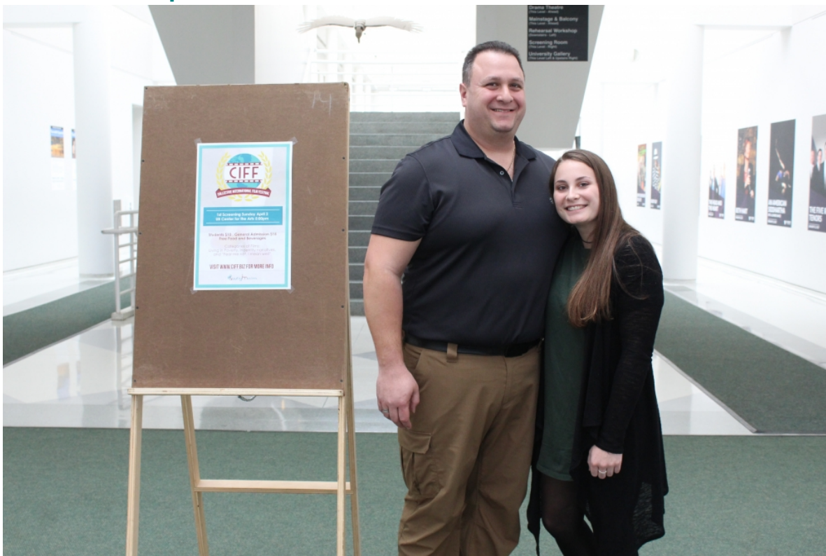
04/02/17 11:08pm | By BENJAMIN BLANCHET