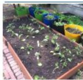
(vegetable and herb garden planted by our Women's Support group)

في أيلول (سبتمبر) الماضي ، عينت منظمة رحمة مدير إداري بدوام جزئي. واجبات المدير الإداري تشمل اعداد والحفاظ على سجلات المستفيدين بما في ذلك التاريخ الاجتماعي وغيرها من المعلومات المهمة ، المساعدة في تحديد الضروريات والاحتياجات الأساسية و من ثم المساعدة في ايجاد الموارد الاجتماعية. التثقيف حول العنف المنزلي . مساعدة المستفيدات من تحديد الأهداف و العمل على وصول هذه الاهداف ، الدعم المعنوي والنفسي المناسب للسيدات من خلال الاجتماع معن شخصياً. وغيرها من الخدمات الضرورية حسب الحاجة، إذا لديكم اي استفسار الرجاء الاتصال بنا على الرقم التالي ٦١٧-٧٧٧-٨٦٤٣