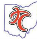
TOURNAMENT OF CHAMPIONS

Tournament Director: *** nt.wrestlingclub@gmail.com