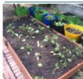
(vegetable and herb garden planted by our Women's Support group)

في أيلول (سبتمبر) الماضي ، عينت منظمة رحمة مدير إداري بدوام جزئي. واجبات المدير الإداري تشمل اعداد والحفاظ على سجلات المستفيدين بما في ذلك التاريخ الاجتماعي وغيرها من المعلومات المهمة ، المساعدة في تحديد الضروريات والاحتياجات الأساسية و من ثم المساعدة في ايجاد الموارد الاجتماعية. التثقيف حول العنف المنزلي . مساعدة المستفيدات من تحديد الأهداف و العمل على وصول هذه الاهداف ، الدعم المعنوي والنفسي المناسب للسيدات من خلال الاجتماع معن شخصياً. وغيرها من الخدمات الضرورية حسب الحاجة. إذا لديكم اي استفسار الرجاء الاتصال بنا على الرقم التالي ٦١٧-٧٧٧-٨٦٤٣