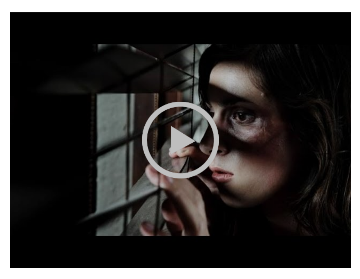
Support Domestic Violence Survivors | RAHAMA Transitional Housing Shelter